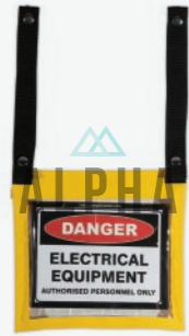
CABLE I.D. CARD POUCHES