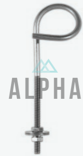
CONVEYOR PULLWIRE CABLE STANDOFF PIGTAIL