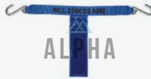
BLUE CABLE HANGING STRAP