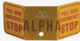
CONVEYOR PIGTAIL EMERGENCY STOP PULLWIRE SIGN