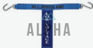
BLUE LOW VOLTAGE CABLE STRAP