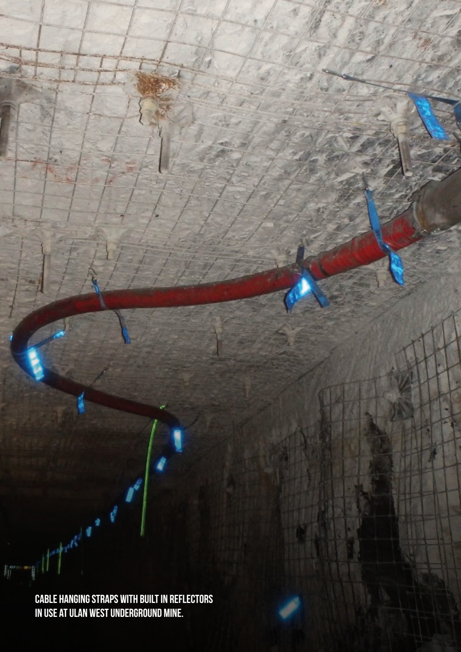
CABLE HANGING STRAPS WITH BUILT IN REFLECTORS IN USE AT ULAN WEST UNDERGROUND MINE.