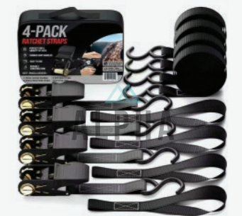
RETRACTABLE RATCHET STRAPS